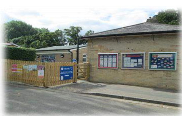
The school dates from 1860 with additions in the 1970's.