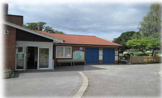
Extensions also took place in 2011 and 2014.

In our efforts to achieve the School Aims , the staff and I rely on parents for co-operation and support. Parents and grandparents are always welcome at Stratford, whether simply for a quick chat, to help with activities and trips or to listen to children read. Your involvement is valued. It is a team effort and your child will benefit when we work together.