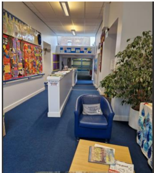
The new main corridor!