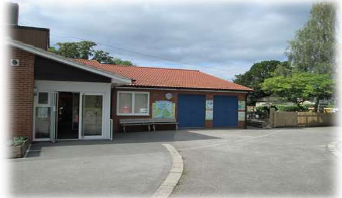
Extensions also took place in 2011 and 2014.

In our efforts to achieve the School Aims , the staff and I rely on parents for co-operation and support. Parents and grandparents are always welcome at Stratford, whether simply for a quick chat, to help with activities and trips or to listen to children read. Your involvement is valued. It is a team effort and your child will benefit when we work together.