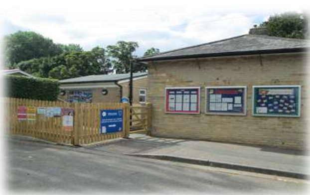
The school dates from 1860 with additions in the 1970's.