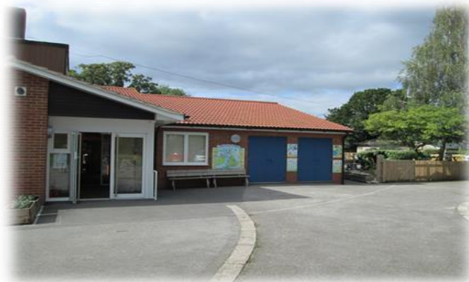
Extensions also took place in 2011 and 2014.

In our efforts to achieve the School Aims , the staff and I rely on parents for co-operation and support. Parents and grandparents are always welcome at Stratford, whether simply for a quick chat, to help with activities and trips or to listen to children read. Your involvement is valued. It is a team effort and your child will benefit when we work together.