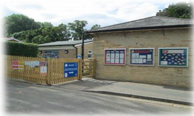
The school dates from 1860 with additions in the 1970's.