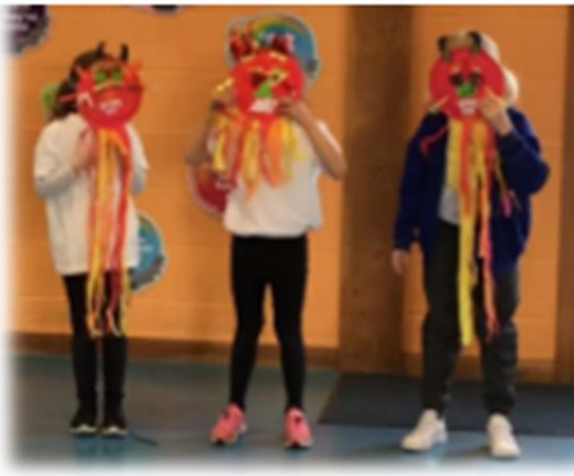
Woodpecker Class made Chinese dragon masks and learnt a traditional Chinese dance to celebrate the 'Lunar New Year'.