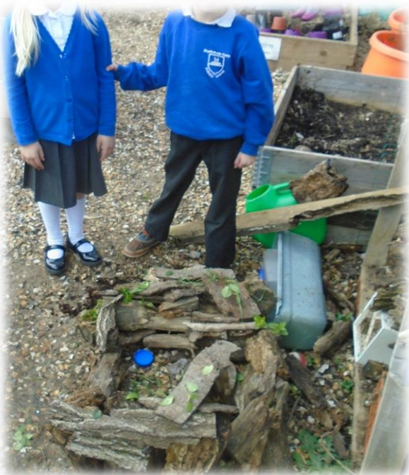
Owl Class have been creating shadow puppets and performing stories. The children designed and made new homes for Ratty, Mole, Badger and Mr Toad.