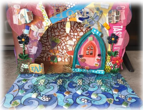
Lexi made this amazing rat house!