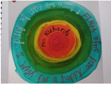
This is my painted circle.