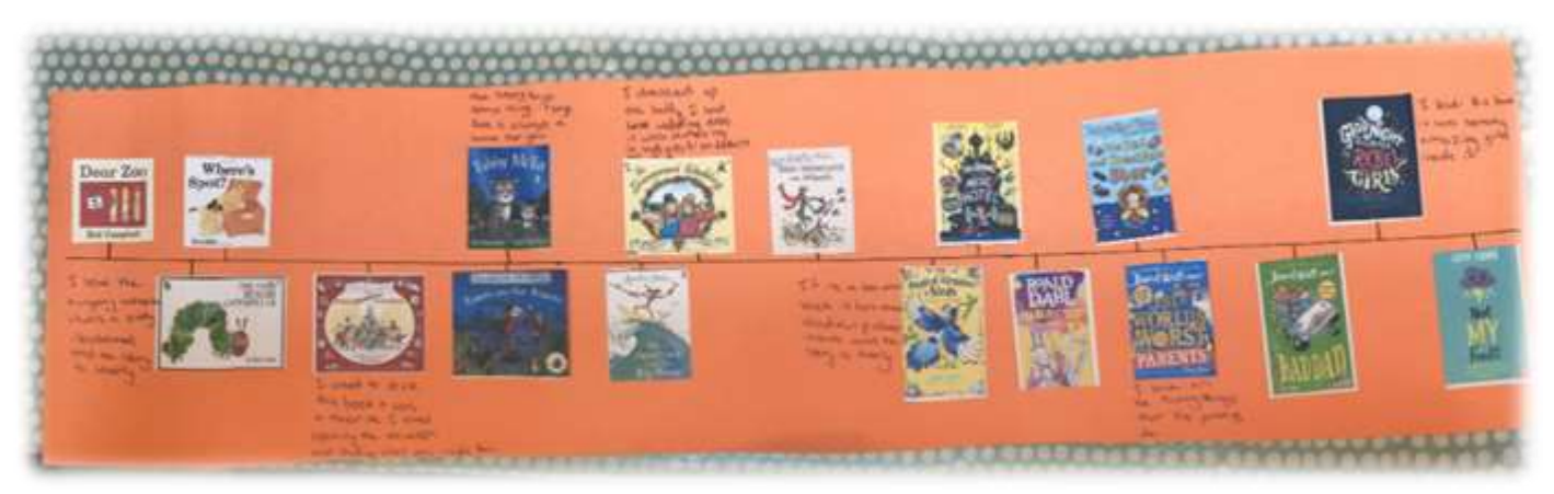
Reading timeline by Annie